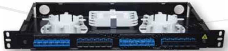
1U F-LIU SC24 Blue Shelf (Splice Trays Shown)