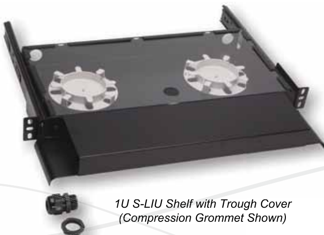
1U S-LIU Shelf with Trough Cover (Compression Grommet Shown)