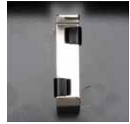
Splice Tray Bracket Locked Position