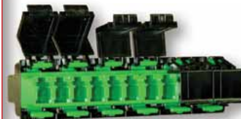
LC Single-Mode Ganged Adapter