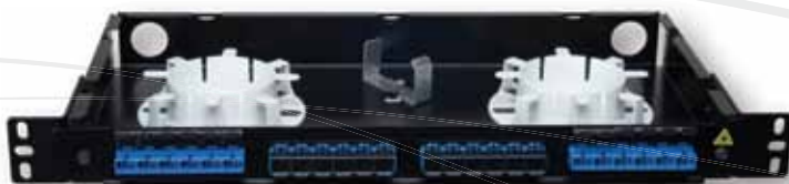
1U F-LIU SC24 Blue Shelf (3 Splice Tray Bracket Shown)