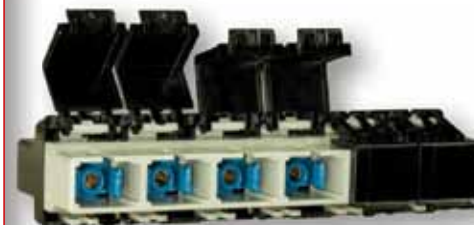
SC Multimode Ganged Adapter