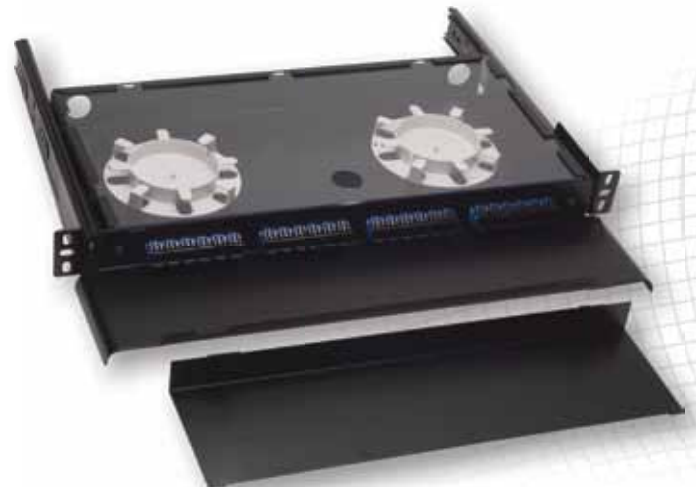
1U S-LIU Shelf (Trough Cover Removed)