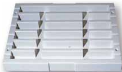
Mass Fusion Holder

2 12A clamps are used to clamp the cable to the frame not the shelf.