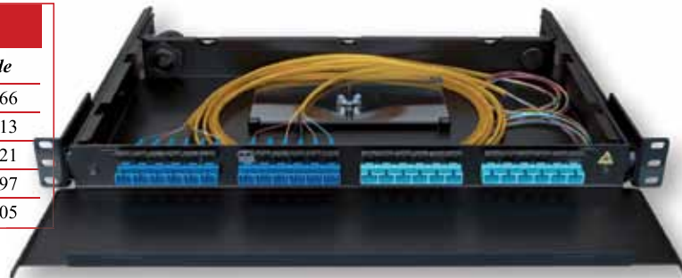
1U Shelf for Cell Towers