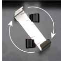
Locking the splice tray bracket

To correctly mount the splice tray bracket, simply place the bracket in between the bracket retainers and turn clock-wise until locked into position as shown (short splice bracket depicted (300522042)).