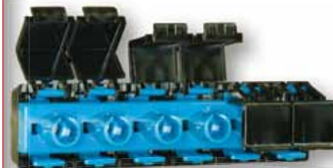
ST Single-Mode Ganged Adapter