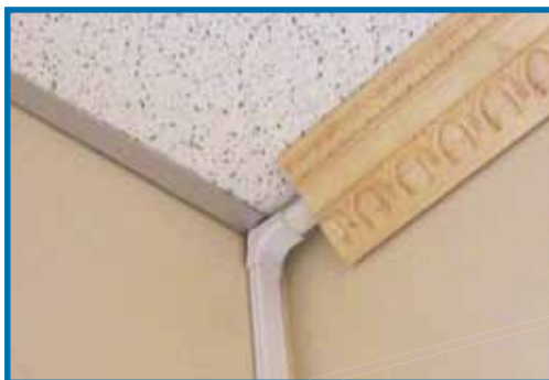
EZ-Bend 3.0 Cable shown bend molding