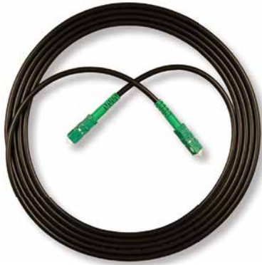
EZ-Bend 3.0 Ruggedized Assembly