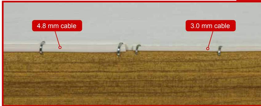
4.8 vs 3.0 mm Cable Comparison (stapled to baseboard)

FOR ADDITIONAL INFORMATION PLEASE CONTACT YOUR SALES REPRESENTATIVE.