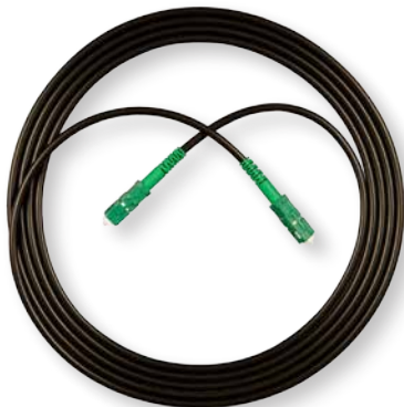
EZ-Bend 4.8 Indoor/Outdoor Cable Jumper