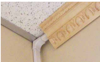
MDU and in-home solution

The robust, leading-edge EZ-Bend Jumpers offer all the advantages of bend-insensitive EZ-Bend Fiber Optic Cables plus the benefits of factory-tuned termination. OFS' EZ-Bend Jumpers allow for customization (i.e, cable diameter and construction, cable length, and termination type) and help save time and money on installation. Their innovative design can conquer sharp corners, moldings, and even stapling, and provides an ideal solution for MDU and in-home wiring applications where space is at a premium.