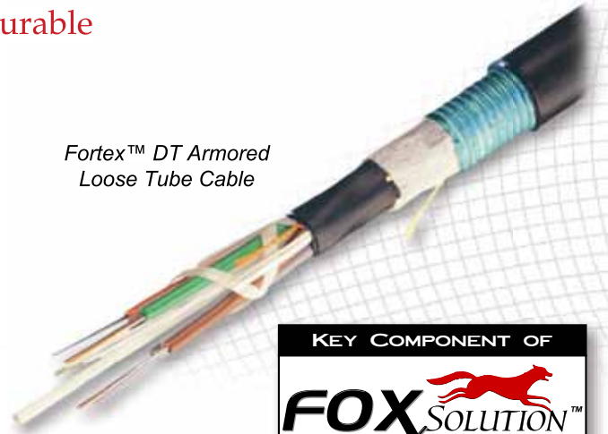
Fortex™ DT Armored Loose Tube Cable

Additional dry, super-absorbent material is applied to the cable core for exceptional water-blocking performance and faster cable preparation. Dielectric strength elements, a ripcord, and an inner polyethylene (PE) jacket are then added. Next, a layer of corrugated electrolytically chrome-coated steel (ECCS) armor tape is applied length-wise over the cable core to provide rugged durability. Finally, a second ripcord and a durable PE outer jacket are added to complete the cable construction.