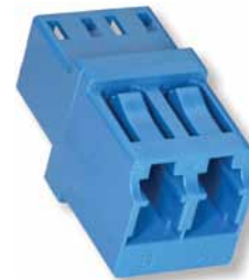
Single-Mode LC Duplex Adapter