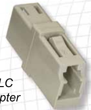
Multimode LC Simplex Adapter