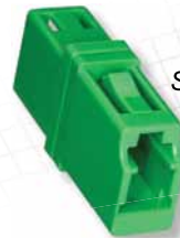
Single-Mode LC Simplex APC Adapter