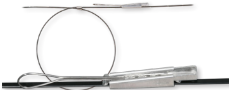
Diamond/Sachs Drop Wire Clamp (Aluminum 1-2 pair, serrated shim)