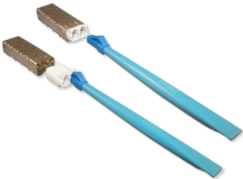
LC SFP Parking Cap With Extraction Tool SFP Cages Not For Sale