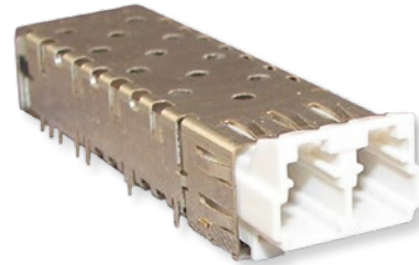
Can and Cap (in)