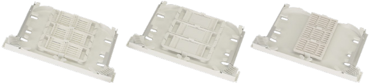
OCEF Splice Trays