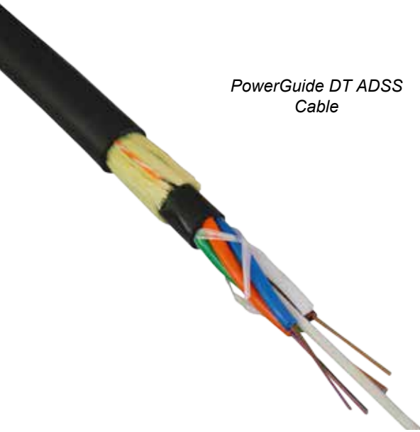
PowerGuide DT ADSS Cable

Totally Gel-Free, ADSS Cable Helps Save Time and Money on Power and FTTH Network Deployments