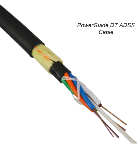
PowerGuide DT ADSS Cable

Totally Gel-Free, ADSS Cable Helps Save Time and Money on Power and FTTH Network Deployments