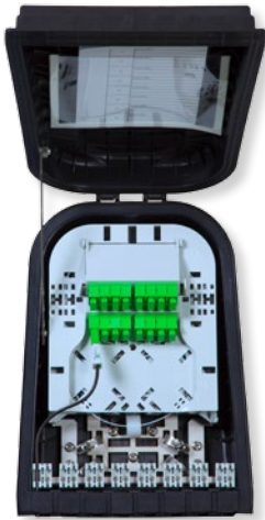
SlimBox Drop Terminal