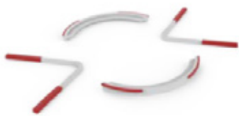
Inside and outside corner protectors