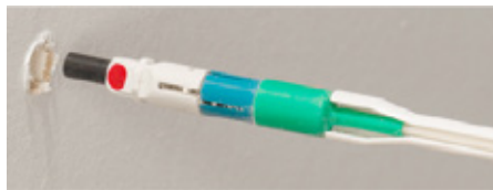
Through wall tool