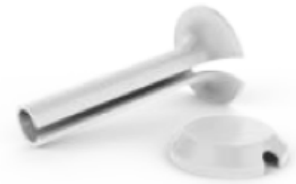
Wall caps and plugs

For additional information please contact your sales representative. You can also visit our website at www.ofsoptics.com or call 1-888-fiberhelp (1-888-342-3743) USA or 1-770-798-5555 outside the USA.