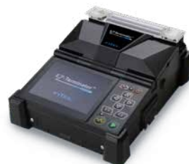
EZ-Terminator Termination Tool