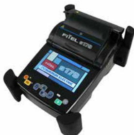
S179A Fusion Splicer