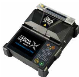
Ninja NJ001 Fusion Splicer

EZ!Fuse Splice On Connector is compatible with the FITEL Fusion Splicers models Ninja, S179, S178 and the EZ-Terminator™.