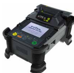
S178A / S153A / S123C Fusion Splicer