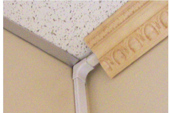
Ruggedized 3.0 mm Drop Cable shown behind molding