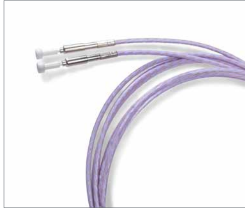
Ease of Termination