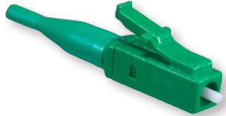
LC APC BTW Connector

Designed to Enhance the Performance of Your Network