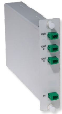
LC Angled Splitter Module

The Angled LC Splitter Modules, used to house and protect single or multiple optical components and fiber leads, provides an LGX® fiber optic distributing system-compatible format to split or couple broadband laser signals within the central office or head-end. These vertically oriented modules plug into standard LGX shelves, enabling incremental application growth and multiple networking options. The module has front-access simplex Angled LC adapters. The number of adapters depends on the split ratio required.