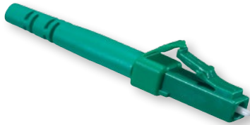
LC APC Unibody® Connector