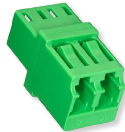
LC Duplex APC Adapter