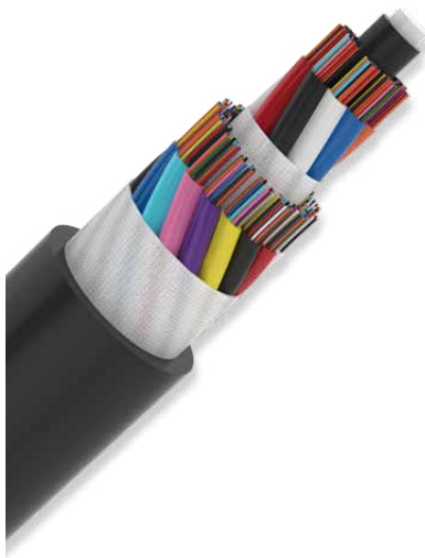
MiDia Dry Core Cable

Helps Increase and Enhance Capacity While Reducing Deployment Costs for Metro Networks