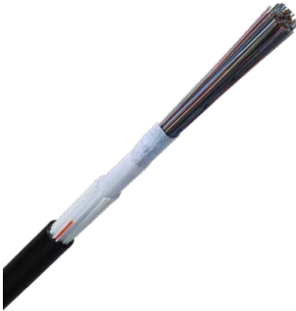
RollR Central Core Rollable Ribbon Fiber Optic Microcable

Increased Fiber Density and Improved Cable Coiling for Performance You Can Count On