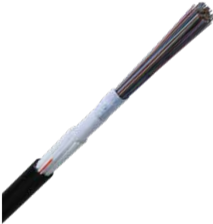
RollR Central Core Rollable Ribbon Fiber Optic Microcable

Increased Fiber Density and Improved Cable Coiling for Performance You Can Count On