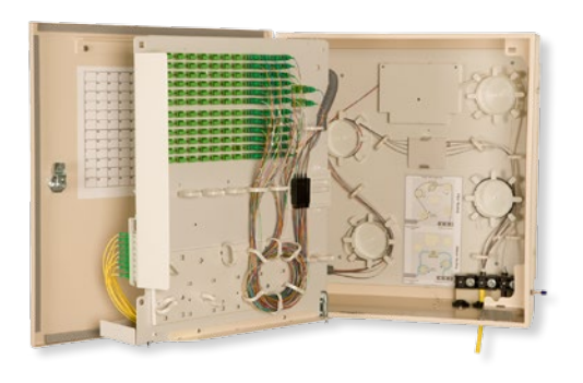
V-Linx FDH Showing Rear Panel Access